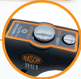
SMART BUTTON manual/automatic use selctable with safety lock