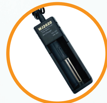
RECHARGE DOCKING STATION WITH USB CONNECTOR