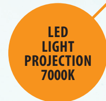
LED LIGHT PROJECTION 7000K