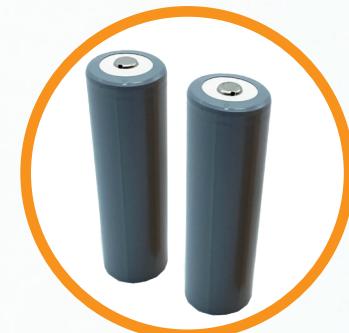
2 BATTERIES 5Ah