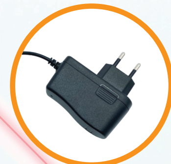
WALL CHARGER available in EU & US plug